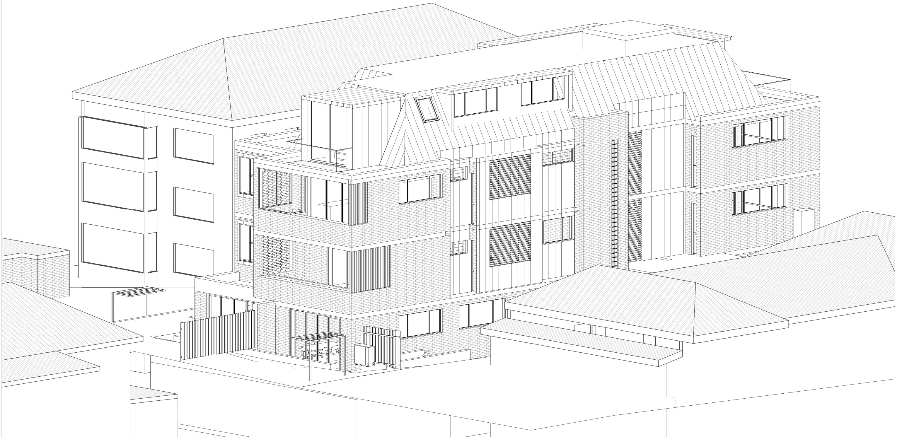
1. Suns Eye View - 8am